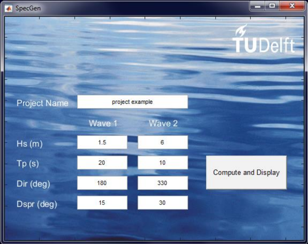
Figure 1 SpecGen Start-up and Computation Window

To compute a spectrum, the characteristics of one or two waves are required. These consist of the significant wave height, Hs (m), peak wave period, Tp (s), wave direction, Dir (deg), and wave spreading, Dspr (deg). In addition, the wave direction is 0 degrees on the axe in eastern direction and increases counter clockwise. The considered values can be submitted to the generator as shown in the Figure 1.