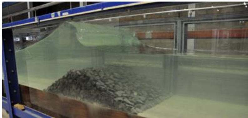
Figure 1. Climate adaptation of coastal structures.